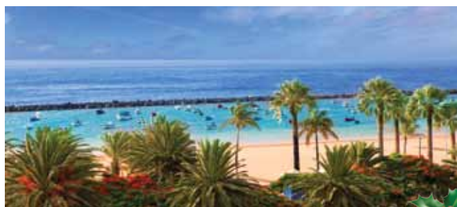
CANARY ISLANDS AT CHRISTMAS 16 NIGHTS - 21 ST DECEMBER 2017