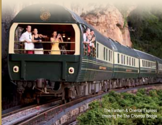
The Eastern & Oriental Express crossing the Tha Chompu Bridge

You will experience superlative service on a journey that will surpass all of your expectations, passing intriguing cities, rural landscapes and gleaming pagodas. Travelling on board the Eastern & Oriental Express is a truly unique way to experience the full wonder of this remarkable region.