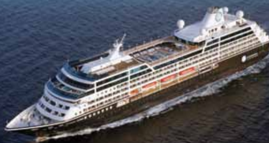
Azamara Journey ®

culture with popular dance and music shows. If you want to get away from the temples and other historical sites, the surrounding countryside is unspoilt, with towering coconut trees and lush rice paddies to be admired