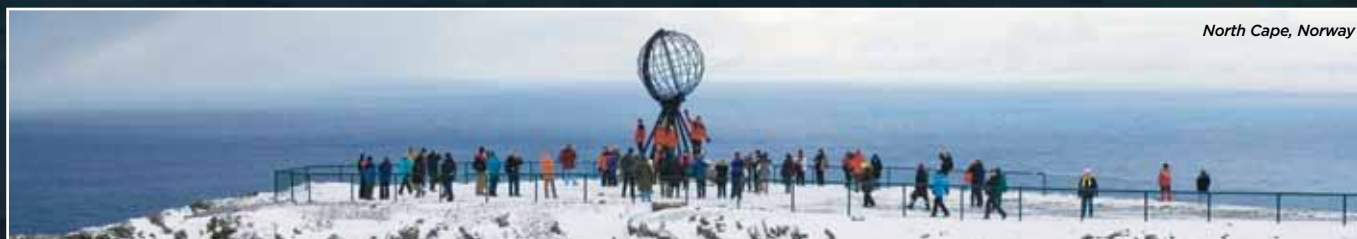
North Cape, Norway

The opportunities that are open to you as a solo traveller are incomparable – enjoy exploring the world with like-minded passengers who will soon become friends; take advantage of no single supplement on the exclusive tailor-made package opposite; and look forward to authentic adventure beneath the Arctic's amazing aurora.