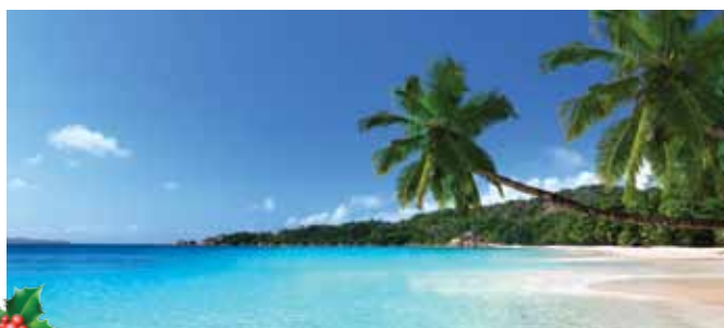
MAIDEN FESTIVE VOYAGE TO THE INDIAN OCEAN 16 NIGHTS - 13 TH DECEMBER 2017