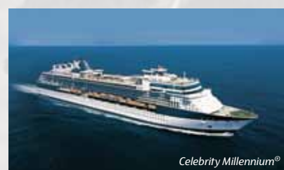
Celebrity Millennium ®

Meals are included on tour as stated B = Breakfast, L = Lunch